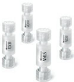
Fig. 1: Four types of Sartobind pico 0.08 mL (the Phenyl pico, HICP above, is not in the selection kit due to different storage requirements.)

Sartobind pico 0.08 ml has a relatively large void volume compared to the Sartorius void volume optimized product line and therefore it is intended for polishing applications in flowthrough mode. If Sartobind is tested for capture application, the binding capacity has to be confirmed with void volume optimized devices, e.g. Sartobind nano 3 mL since the smaller void volume has a positive effect on binding capacity.