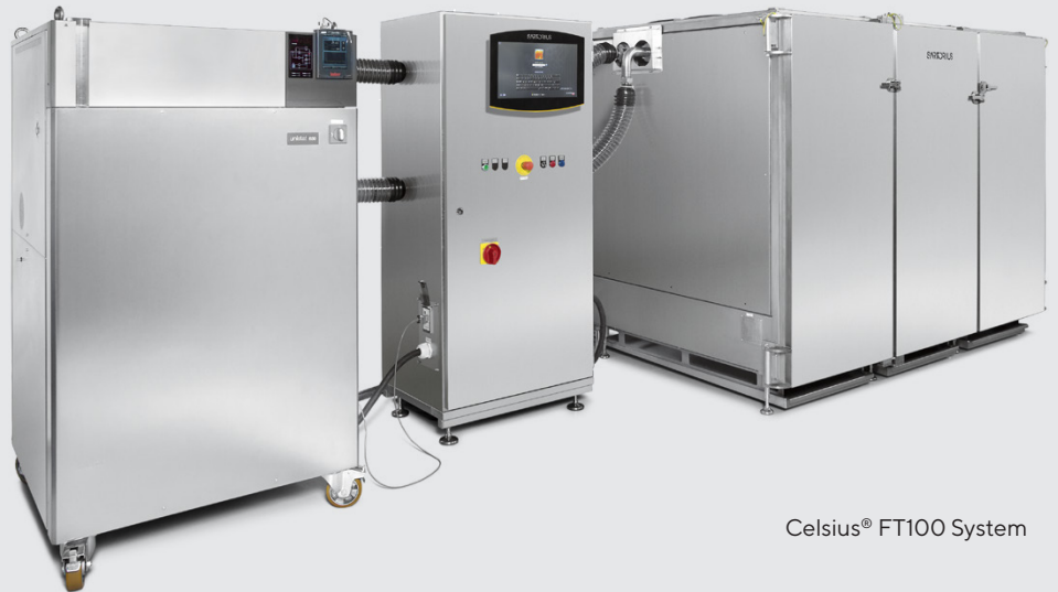
Celsius® FT100 System

Celsius® CFT processes up to 100 L of product per cycle, and offers well-qualified shipping solutions for transferring the frozen drug substances around the world.