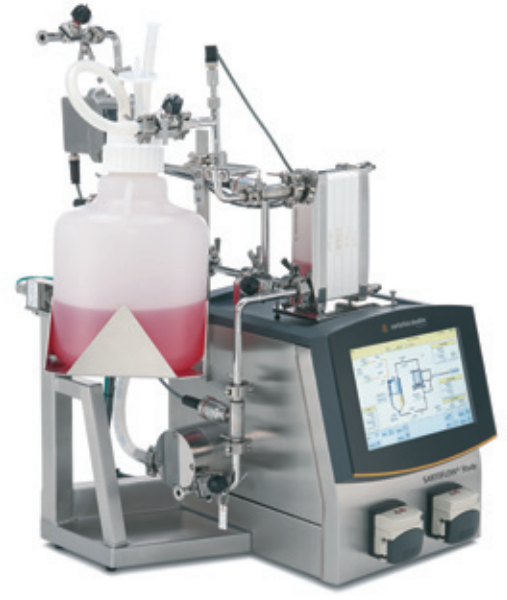
SARTOFLOW® Study filtration module with tank (316L) module