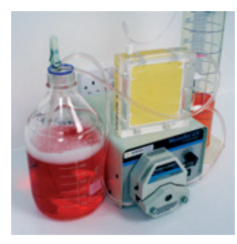
Fig. 1a. and 1 b: Vivaflow® 200 set up before (1a) and during (1b) the sample concentration process.