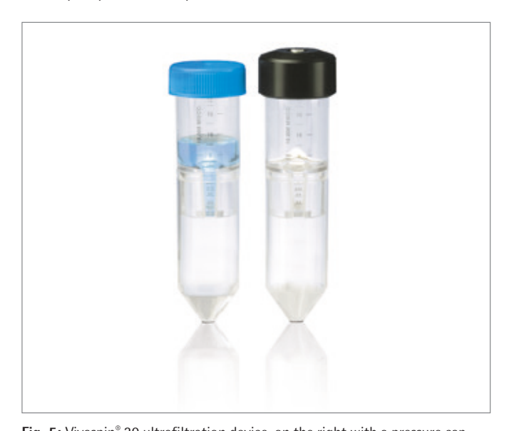
\textbf{Fig. 5: } Vivaspin^{@}\ 20\ ultrafiltration\ device, on the right with a pressure cap which allows pressurization of the device as well and the regular utilization in a centrifuge.

The eluate was then concentrated in a Vivaspin® 20 (PES, 5 kDa MWCO), Figure 5., and centrifuged at 5000 xg for 10 min. or until approximately 2 ml of concentrate had been collected. The device was then re-filled with 18ml 50mM Potassium Phosphate buffer, pH 7.2 to 20 ml for a final buffer exchange and desalting of the purified sample. The sample was again centrifuged until a final sample volume of 2 ml had been attained. A BCA test revealed a 97 % lysozyme recovery.