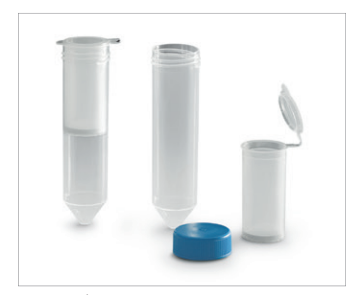
Fig. 4: Vivapure® Maxi spin columns can be used in a centrifuge for fast and easy protein purification.

Two Vivapure® Maxi H S type devices (Fig. 4) were equilibrated with 10 ml of 25 mM Sodium Acetate, pH 5.5 each, by filling with 10 ml of this buffer and centrifuging for 5 min. in a swing bucket centrifuge at 500 xg and discarding the flow through. Using the concentrated and buffer exchanged sample from Part 2, 10 ml sample were pipetted into each of these two equilibrated Vivapure® devices and centrifuged again for 5 min. in a swing bucket centrifuge at 500 xg. The Vivapure® devices were washed with further 10 ml of 25 mM Sodium Acetate, discarding the flow through, followed by an elution step with 5 ml of 1 M NaCl in 25 mM Sodium. A BCA test revealed a 95 % lysozyme recovery.