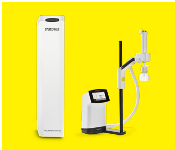
Supply pure water from Arium® Bagtank