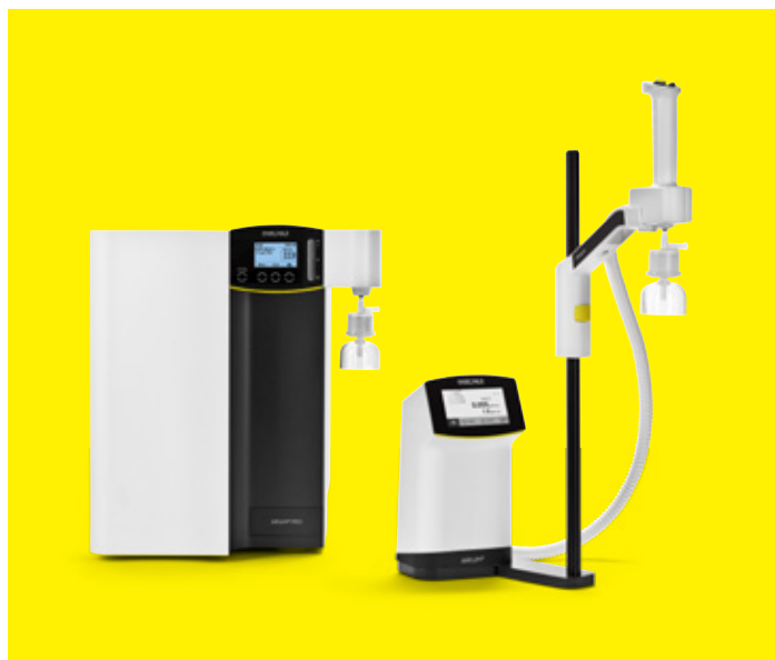
Supply ultrapure water from Arium® Pro and Arium® Comfort

The stepless height adjustment from 8.5 – 65 cm allows you to fill different sized containers. Thanks to its angular designed stand even bulky vessels can be optimally positioned under the dispense outlet. Depending on your needs you can adjust the volume dispense from 50 mL up to 50 Liter.