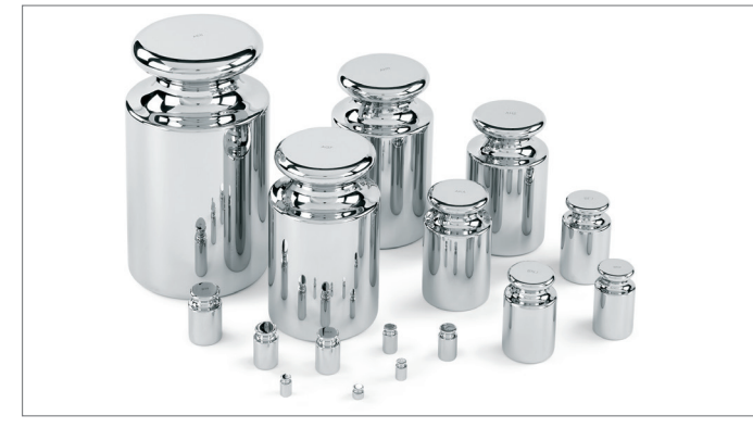
Figure 3: Class E2 knob weights from the "ProofLine" series from Sartorius.

And similarly to the balances, there is no necessity to postpone an intended purchase of a weight to after 20.05.2019.