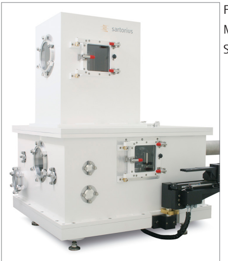
Figure 2: Mass comparator Sartorius CCL1007.

It speaks for itself that even at the very highest metrological level Sartorius' know-how and technology are trusted.