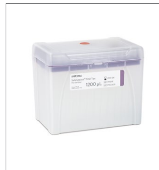
Single Tray racks purity-certified tip racks