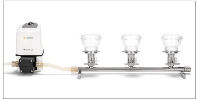
Microsart® Manifold with 100ml Microsart® Funnels and Microsart® e.jet Pump (Pump and Funnels are not included in the delivery content)