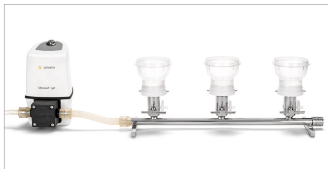
Microsart® Manifold with Microsart® @filter units and Microsart® e.jet Pump (Pump and Filtration units are not included in the delivery content)