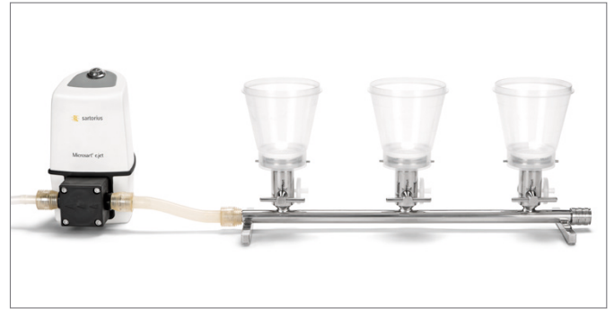
Microsart® Manifold with Biosart 250 Funnels and Microsart® e.jet Pump (Pump and Funnels are not included in the delivery content)