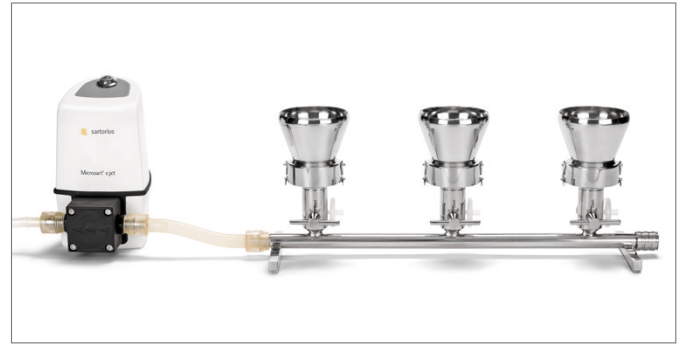
Microsart® Manifold with 100 ml Stainless Steel Funnels and Microsart® e.jet Pump (Pump is not included in the delivery content)