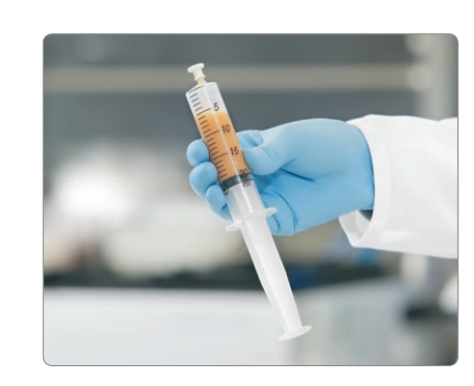
2. Shake the syringe to mix the broth with the filter aid.