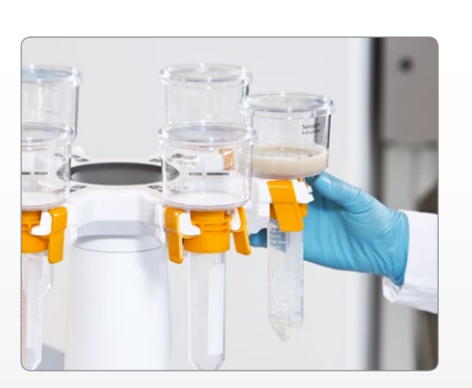
3. Push the filtration unit to apply vacuum to the unit and to start the filtration (second click).