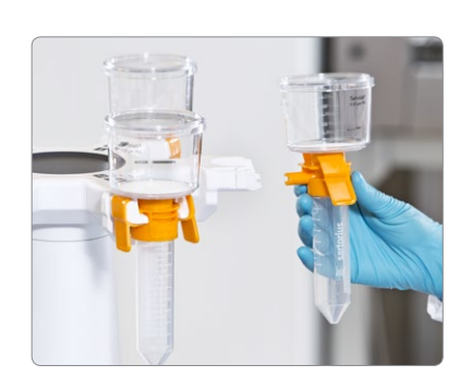
1. Attach the Sartolab® RF 50 unit to the MultiStation on hold position (first click).

Hands-free parallel clarification and sterile filtration of cell cultures in just a few seconds