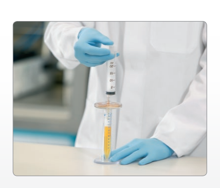
4. One minute later, the clarified cell culture liquid is available for subsequent downstream processing steps, such as protein purification and concentration.