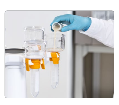
2. Pour the cell culture and filter aid mixture into the Sartolab® RF 50.