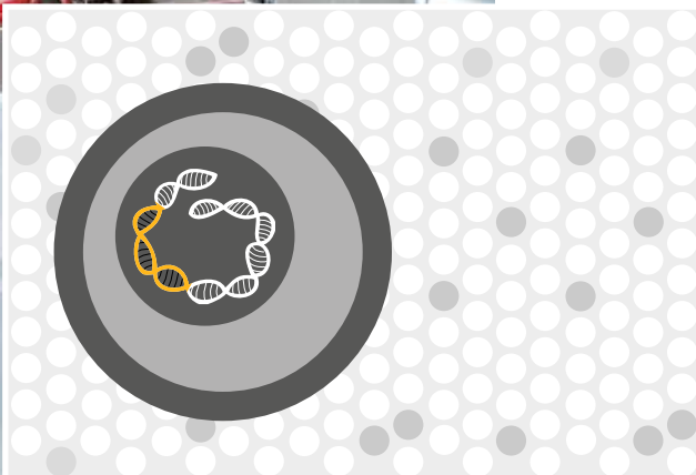
Host cell with modified DNA in a cell culture medium.

From cell cultivation to harvesting, purification, final formulation and filling, Sartorius covers nearly all steps in the production process of a biopharmaceutical. Our comprehensive bioreactor portfolio makes us the worldwide leader in upstream processing. In the downstream sector, we are advancing technology by developing innovative and enhanced single-use technologies, such as membrane chromatography, body feed filtration for antibody harvesting, and freeze and thaw systems.