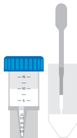
3 LC/MS-ready filtrate