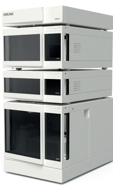
Figure 2: Patfix®