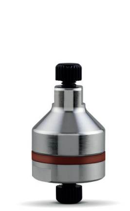
Figure 1: CIMac SO3 Analytical Column

Fast, accurate, and meaningful characterization of cell culture harvests and in-process samples is critical for both process development and for documentation of in-process control. UV analysis of chromatography profiles has been a valuable tool for decades, but it has major limitations with respect to sensitivity and its ability to discriminate the product of interest from particular contaminant classes. In this study we use filtered lysate containing AAV 8 to demonstrate the ability of a strong cation exchange monolith CIMac SO3-0.1 coupled with multiple monitors to enable high sensitivity detection of AAV capsids while characterizing the relative distributions of DNA and protein contaminants. This approach can be used to evaluate cell culture methods, influence of harvest time, lysis methods, and effectivity of purification methods across a process.