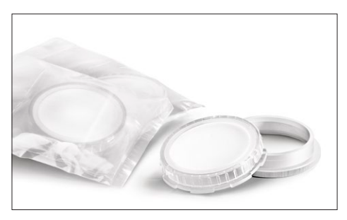
Gelatin Membrane sampling heads

Water soluble gelatin membrane filters are the perfect way to quickly capture SARS-CoV-2 in air samples.