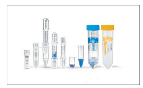
Vivaspin® Centrifugal Filtration Device from 100 \, \mu l to 20 \, mL

The product range includes several membrane materials and molecular weight cutoffs (MWCO), to cover a wide range of applications.