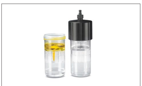
Vivaspin® Centrifugal Filtration Device from 20 mL to 100 mL