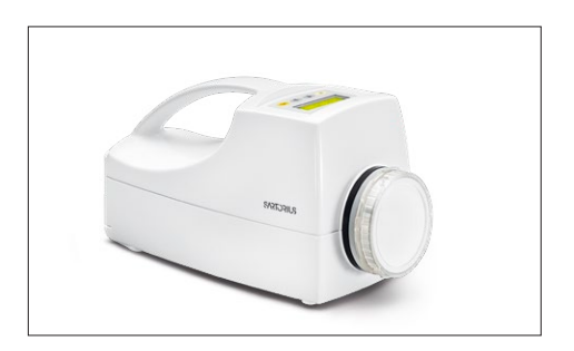
MD8 AirPort air sampler

With the help of the portable AirPort MD8 air sampler, the air of all high-contamination risk areas can be sampled for coronavirus. After sampling, the membrane filter can be dissolved in minimal volumes of water or buffer. aiding with RNA sample preparation prior to rapid tests methods such as PCR.