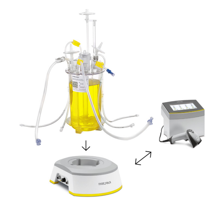
Figure 1: Univessel<sup>®</sup> SU With Holder and Connection Box

The Univessel® SU is a 2 L working volume single-use bioreactor that meets the design criteria of conventional glass bioreactors. Furthermore, it potentially increases the bioreactor controller run time by up to 25%. In this study, we have demonstrated the successful batch cultivation of CHO DG44 in serum free, chemically defined media. Cell densities of of 6.8 × 10<sup>6</sup> cells/mL, which are typical for the particular clone when grown in a conventional bioreactor, could easily be reached while maintaining good viability.