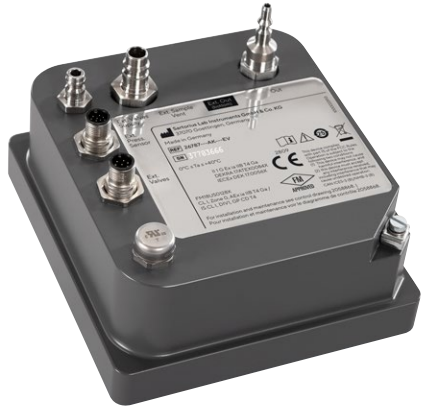
Accessory Kit for External Venting

The accessory kit is certified for use in hazardous areas (ATEX, IECEx, FM) and can be used with alcohol-wetted filters. It can be used with the standard tubing length of 2 and 5 meters. The pneumatic flow path of the AKEV can be cleaned with up to 0.5 M NaOH at max 50 °C when using the Automated Cleaning Kit.