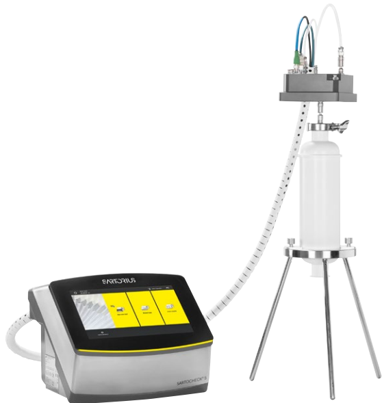
Setup of Accessory Kit for External Venting

The optional Accessory Kit for External Venting (AKEV) consists of a venting valve and a blocking valve and includes a pressure sensor that is identical to the one used inside the Sartochek® 5. The kit can be used in conjunction with the Sartochek® 5 to avoid any unwanted siphoning of liquid. This precludes cross -contamination between product-soaked filters being post-use tested and new filters being pre-use tested (e.g., PUPSIT).